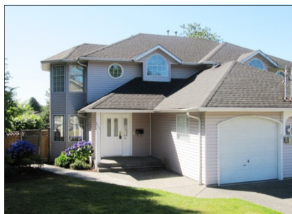
$559,800.00 642 Girard, Coquitlam

Spacious, Bright, 3 Bdrm + 3 Bath 1/2 Duplex in excellent condition, recently renovated, also new paint and Appliances. Features are Wet Bar, Gas f/p, full Ensuite in Master Bedroom and walk down crawl space for extra storage. Professionally landscaped fully fenced back yard with Hot Tub, Fish Pond and Gazebo, in a private setting. Located in West Coquitlam on a quiet cul-de-sac close to Lougheed Mall, Skytrain and Simon Fraser University.