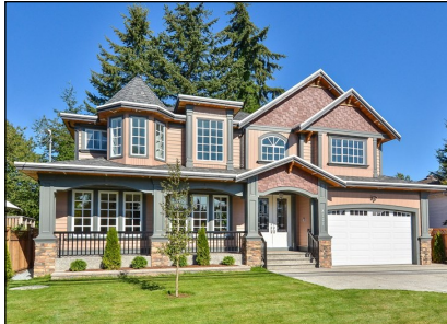
$1,089,000.00 8122 112 th St, North Delta

New, custom built, luxurious home with no expenses spared, extensive detail in fine workmanship, custom built-in cabinetry thru-out. This fine 3 level exceptional quality home features almost 4300 sq.ft. of open living space with 4 bdrms up (2 master ensuites), den/bdrm on main flr. Huge theatre room down, 1 bdrm + bath, plus self-contained, legal 2 bdrm suite with own laundry. Huge gourmet kitchen with fine detail cabinets & mouldings, Quartz counters & island. Spice kitchen includes high quality gas stove. Too many features & extras to list. Must see to appreciate. Close to Sands Sec. School, Gray Elementary, Sun God Rec. Centre, Burns Bog, Transit, and shopping. Easy access to Alex Fraser Bridge & Richmond.