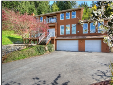
$999,998.00 4228 Bedwell Bay Rd, Belcarra

New, custom built, luxurious home with no expenses spared, extensive detail in fine workmanship, custom built-in cabinetry thru-out. This fine 3 level exceptional quality home features almost 4300 sq.ft. of open living space with 4 bdrms up (2 master ensuites), den/bdrm on main flr. Huge theatre room down, 1 bdrm + bath, plus self-contained, legal 2 bdrm suite with own laundry. Huge gourmet kitchen with fine detail cabinets & mouldings, Quartz counters & island. Spice kitchen includes high quality gas stove. Too many features & extras to list. Must see to appreciate. Close to Sands Sec. School, Gray Elementary, Sun God Rec. Centre, Burns Bog, Transit, and shopping. Easy access to Alex Fraser Bridge & Richmond.